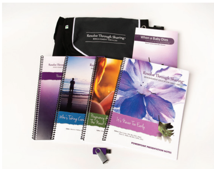
The RTS program offers a variety of training and support materials.